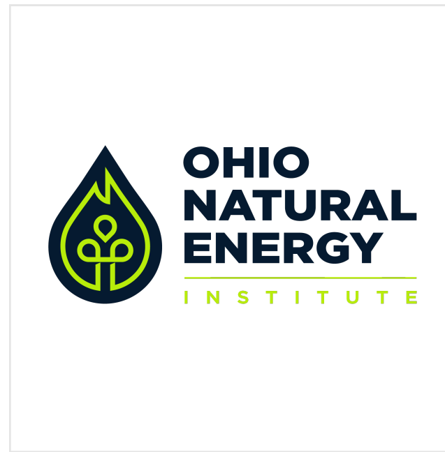
SQAURE PROFLIE PICTURE